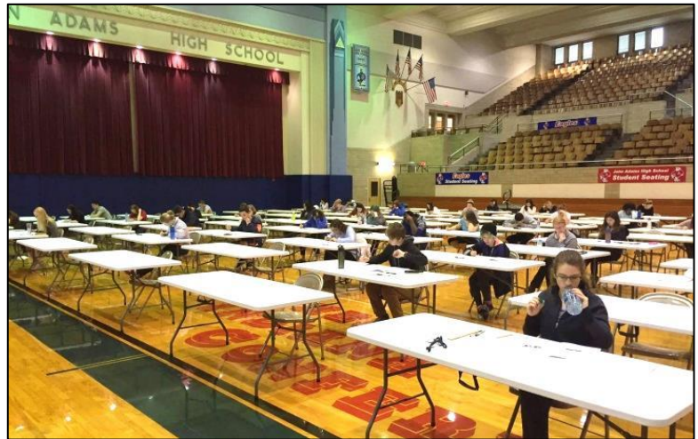
A total of 79 English HL students take their IB exam in the main gymnasium