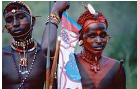
Men of the Samburu tribe in Kenya.

We are pleased to announce the addition of a new IB HL course to our curriculum. Beginning Fall 2012, students can take Social and Cultural Anthropology HL, expanding the course selection options for Group 3 courses dealing with individuals and societies.