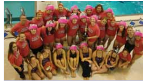
The John Adams Girls' Swim Team celebrates their victory at the City Meet in December.