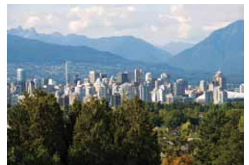
Vancouver, British Columbia, Canada.