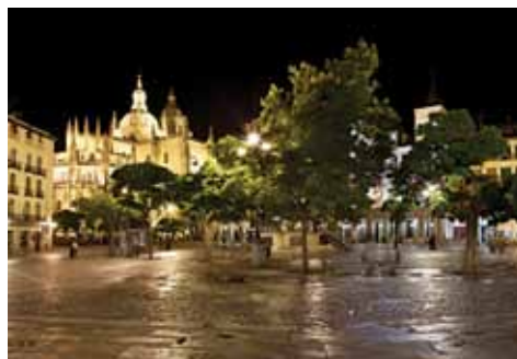
Plaza Mayor in Segovia, Spain

Here at the IB Intellect, we hope that everyone had a good break and did well with final exams for the first semester. It's hard to believe that we have reached the halfway point of the school year already! A new semester brings new courses that will be exciting and challenging. We wish everyone much success as you move forward and continue to excel.