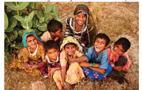
Indian children from Rajasthan, India.

Social and cultural anthropology is the comparative study of culture and human societies. Anthropologists seek an understanding of humankind in all its diversity. This understanding is reached through the study of societies and cultures and the exploration of the general principles of social and cultural life. Social and cultural anthropology places special emphasis on comparative perspectives that challenge cultural assumptions. Many anthropologists explore problems and issues associated with the complexity of modern societies in local, regional and global contexts. Topics of anthropological inquiry include social change, kinship, symbolism, exchange, belief systems, ethnicity and power relations. Social and cultural anthropology examines urban as well as rural society and modern nation states (IBO). Look for this new course option this fall.